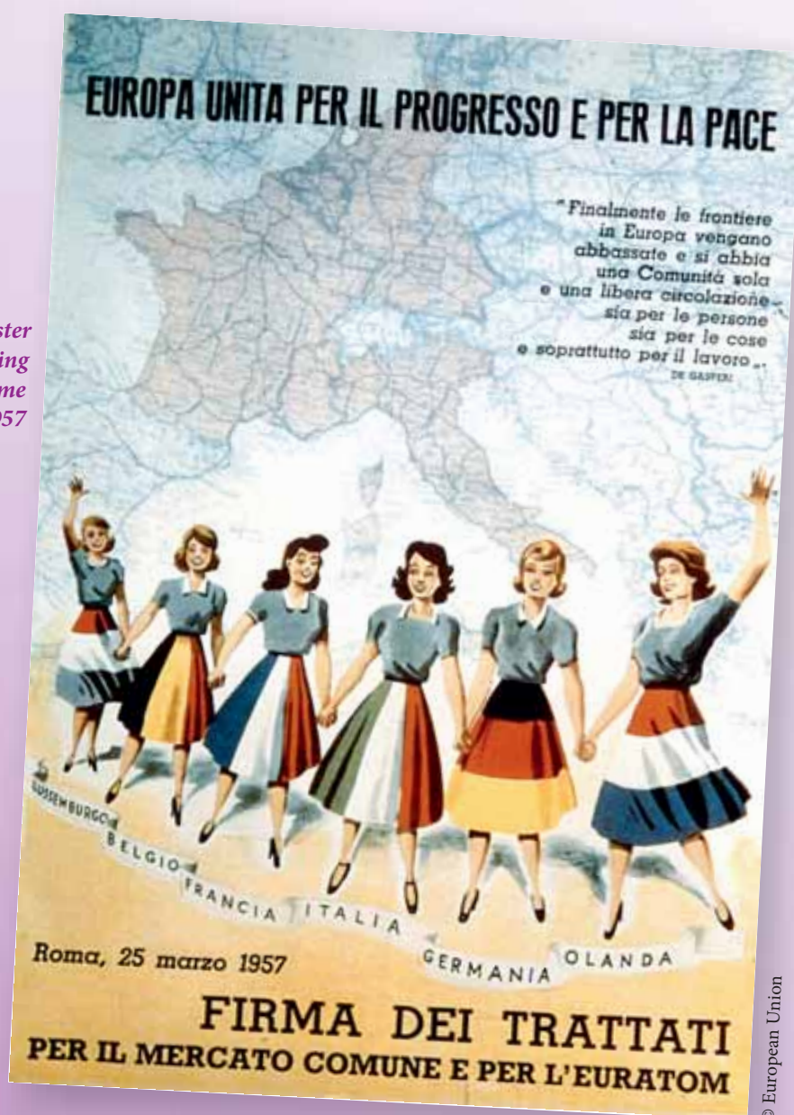
Italian poster celebrating the signing of the Treaties of Rome on 25 March 1957

The second treaty established the European Atomic Energy Community (EAEC or Euratom) . The objective of the EAEC Treaty was to coordinate and pool Member States' research programmes on the civilian use of nuclear energy.