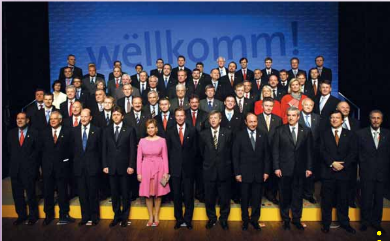
Family photo on the occasion of the signing of the Treaty on the Accession of Bulgaria and Romania (Luxembourg, 25 April 2005)

As it was not possible for the Constitutional Treaty to enter into force, fresh negotiations were launched in 2007 leading to the signing on 13 December 2007, and the entry into force on 1 December 2009, of the Treaty of Lisbon .