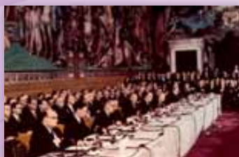
25 March 1957 in Rome during the signing ceremony for the EEC and Euratom Treaties