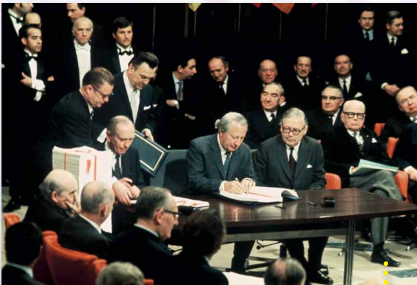
Edward Heath signing the UK Accession Treaty (Palais d'Egmont, Brussels, 22 January 1972)

In the course of the same period, the Treaty concerning the accession of the Kingdom of Denmark, Ireland and the United Kingdom of Great Britain and Northern Ireland to the EEC and the EAEC was signed on 22 January 1972 and entered into force on 1 January 1973. A Council Decision of 22 January 1972 also provided for accession to the ECSC. Meanwhile, following a negative referendum result on 25 September 1972, Norway withdrew from the accession process (3) .