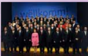
25 April 2005 in Luxembourg during the signing ceremony for the Treaty of Accession of Romania and Bulgaria