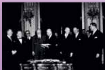
18 April 1951: the Treaty of Paris establishes the ECSC: Paul van Zeland, Belgian Foreign Affairs Minister; Joseph Bech, Luxembourg Foreign Affairs Minister; Joseph Meurice, Belgian Foreign Trade Minister; Carlo Sforza, Italian Foreign Affairs Minister; Robert Schuman, French Foreign Affairs Minister; Konrad Adenauer, German Federal Chancellor and Federal Foreign Affairs Minister; Dirk Stikker, Netherlands Federal Foreign Affairs Minister; Johannes van den Brink, Minister for Economic Affairs of the Netherlands