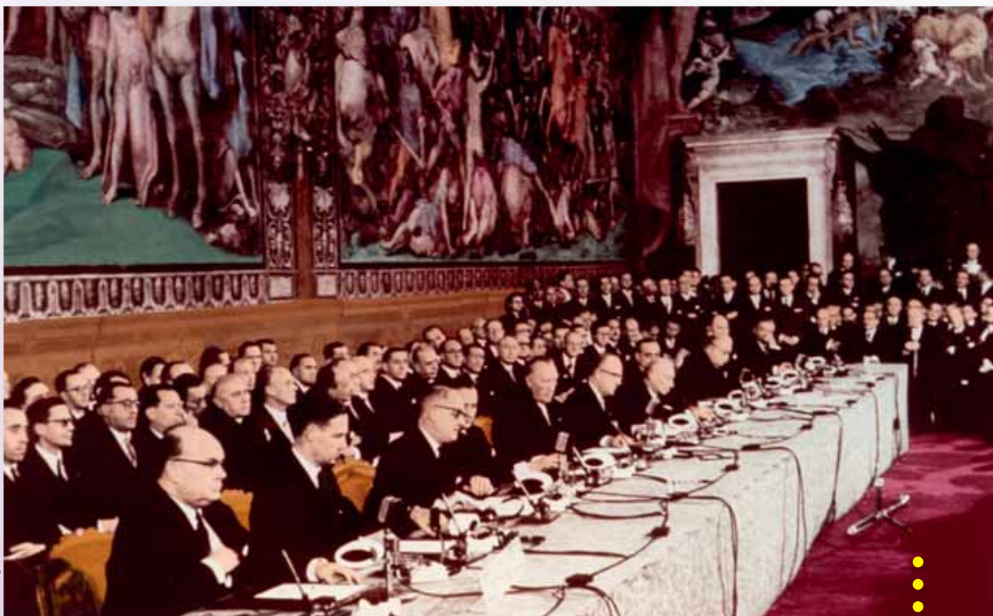
Signing of the EEC and Euratom Treaties (Hall of the Horatii and Curiatii at the Capitol in Rome, 25 March 1957)

After the failure of the European Defence Community, the economy became the focus of the European project. Following a conference held in Messina on 1 and 2 June 1955, a committee chaired by the Belgian Minister for Foreign Affairs, Paul-Henri Spaak, was tasked with modelling a European common market. The committee produced two draft texts which were to become known as the Treaties of Rome, after the city in which the Inner Six signed them on 25 March 1957. They entered into force on 1 January 1958.