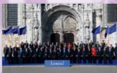
13 December 2007 in Lisbon when the Treaty was signed